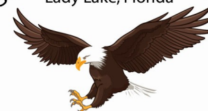
R/C Flying - For Fun

Southern Eagle Squadron Lady Lake, Florida